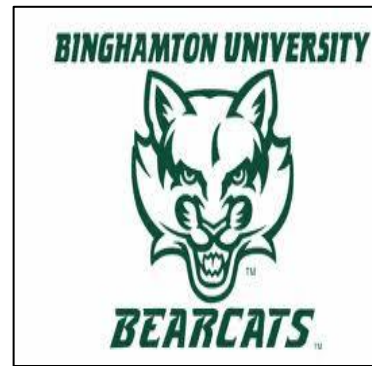
Steven DelValle EECE 351 – Digital Systems Design