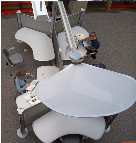
Transformed space accommodates individual and group study, public computing, and the Library's print reference collection.