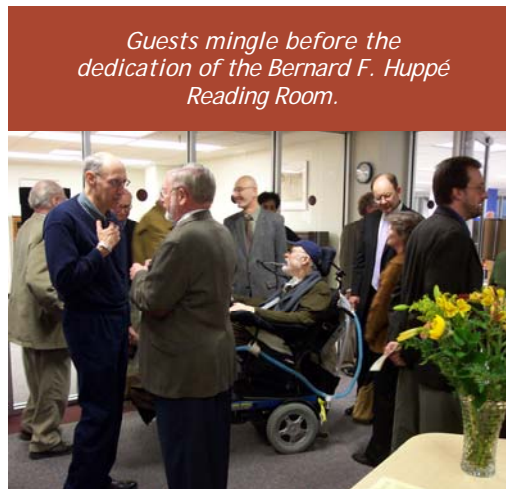
Guests mingle before the dedication of the Bernard F. Huppé Reading Room.