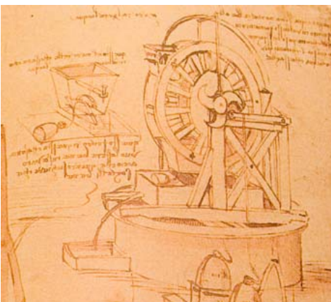
Detail from da Vinci's Il Codice Atlantico della Biblioteca Ambrosiana di Milano.