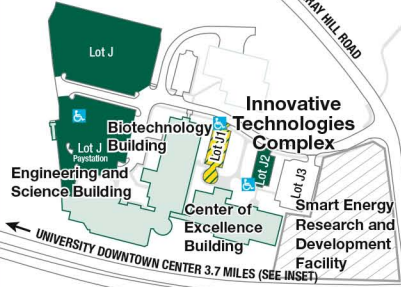
Innovative Technologies Complex Center of Excellence Building Smart Energy Research and Development Facility UNIVERSITY DOWNTOWN CENTER 3.7 MILES (SEE INSET)